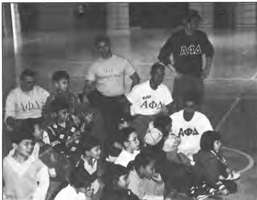
Brothers of Theta Beta chapter regularly join the students of Public School 126 in New York's Chinatown for school activities.

The busy chapter also planned a student-versus-faculty volleyball tournament for the latter half of the fall semester to benefit Toys for Tots, which provides Christmas presents to needy families. It is also continuing its participation in the Adopt-A-Highway program, in which the chapter cleans up two roads near the college.