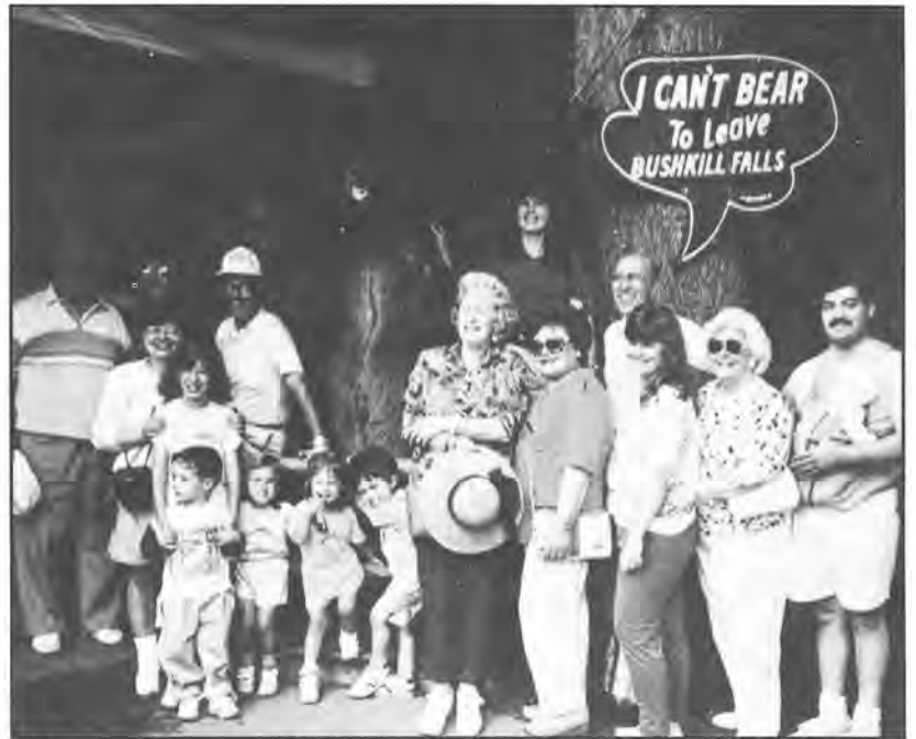
This hearty group of Alpha Phi Delta conventioners crossed over hills and gorges to see the magnificent sights at Bushkill Falls in the Pocono Mountains.