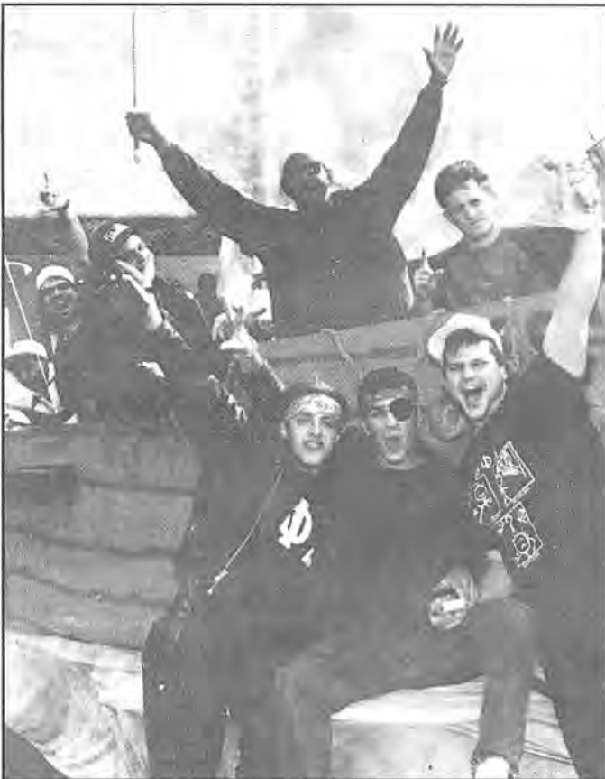
The brothers of Gamma Omicron chapter at S.U.N.Y. at Stony Brook recently won the homecoming float contest for the second year in a row.