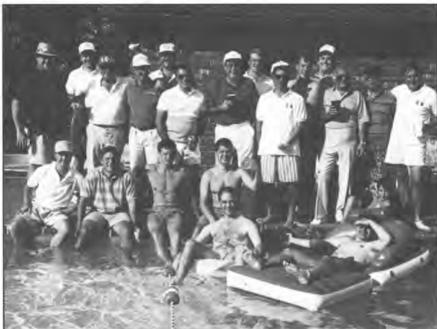
Pittsburgh Alumni Club brothers cool off after a hard day on the golf course.