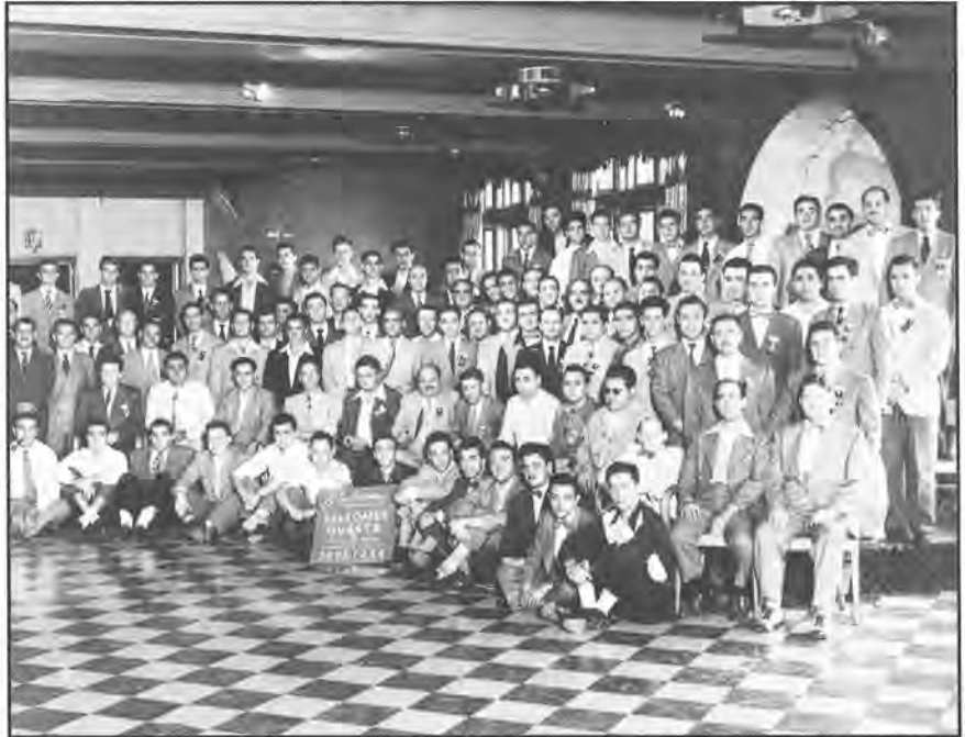
Let's get together for a week of sun, fun and brotherhood at the Alpha Phi Delta Summer Convention, just like they did in this 1948 photo.

The Alpha Phi Delta convention begins Monday evening with a welcoming cocktail party and dinner. Tuesday we'll visit a fine local Italian restaurant, where you can order your favorite dishes a la carte . Wednesday night is a family fun pizza party. The traditional awards banquet and cocktail party highlight Thursday evening. After dinner join your brothers for conversation and refreshments at our deluxe hospitality suite, or take in some Ocean City nightlife.