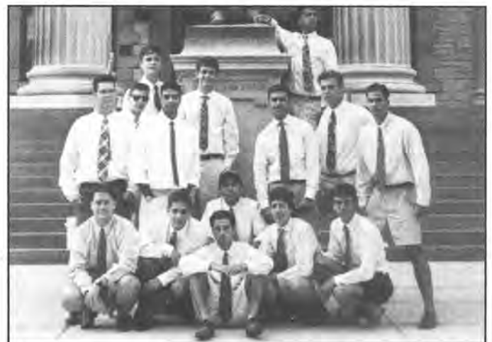
The brothers of Delta Kappa chapter at Binghamton College, shown in front of Binghamton City Hall, work with underprivileged children in the town.

Delta Kappa chapter at Binghamton (N.Y.) University is involved in a program which sends students out to work with underprivileged children on weekends. The chapter is also becoming very closely tied to the school's Italian Student Union, and they are gaining the support of many of the existing Greek organizations. ■