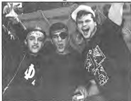
Gamma Omicron wins again!