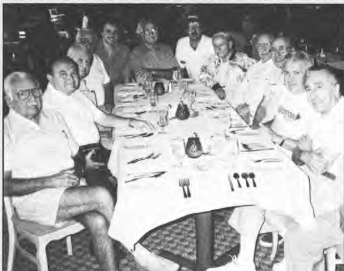
The Alumni Emeritus Club, brothers of Alpha Phi Delta for more than 50 years, enjoy their annual luncheon at the Summer Convention in the Poconos.

with pride and fondness of the past. But today is today. We are made up of younger, diverse men and older, Italian-American men. We can co-exist and continue to grow. The older members are needed to be present to remind and teach the younger brothers about the heritage and purpose of the organization.